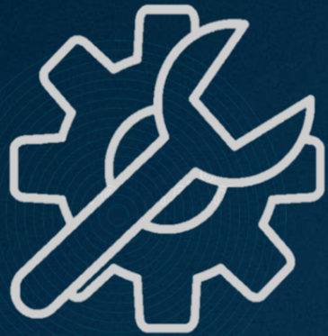
Warranty Coordination & Repairs

Whether your equipment is at the end of its life cycle or needs repairs, we will help you plan and support you every step of the way through reporting, warranty coordination, repair and disposal.