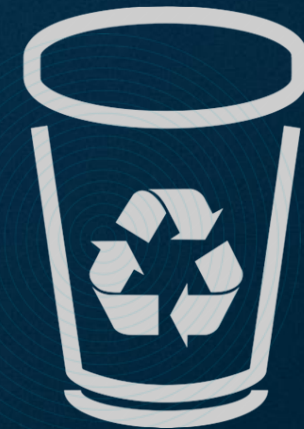
Disposal of Equipment